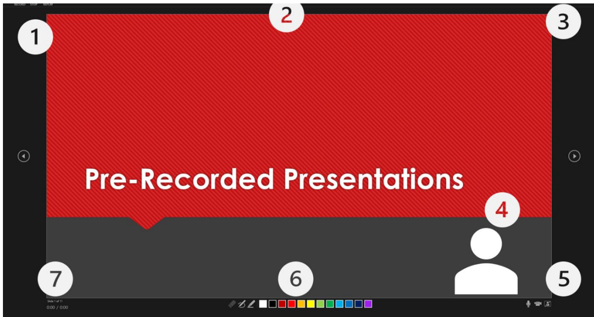
Fig. 2: Recording screen for PowerPoint

6. Then save the video using the PowerPoint export function