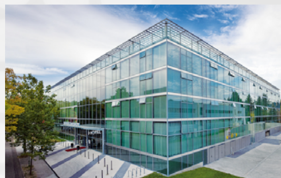
Seminaris , Berlin-Dahlem, Germany